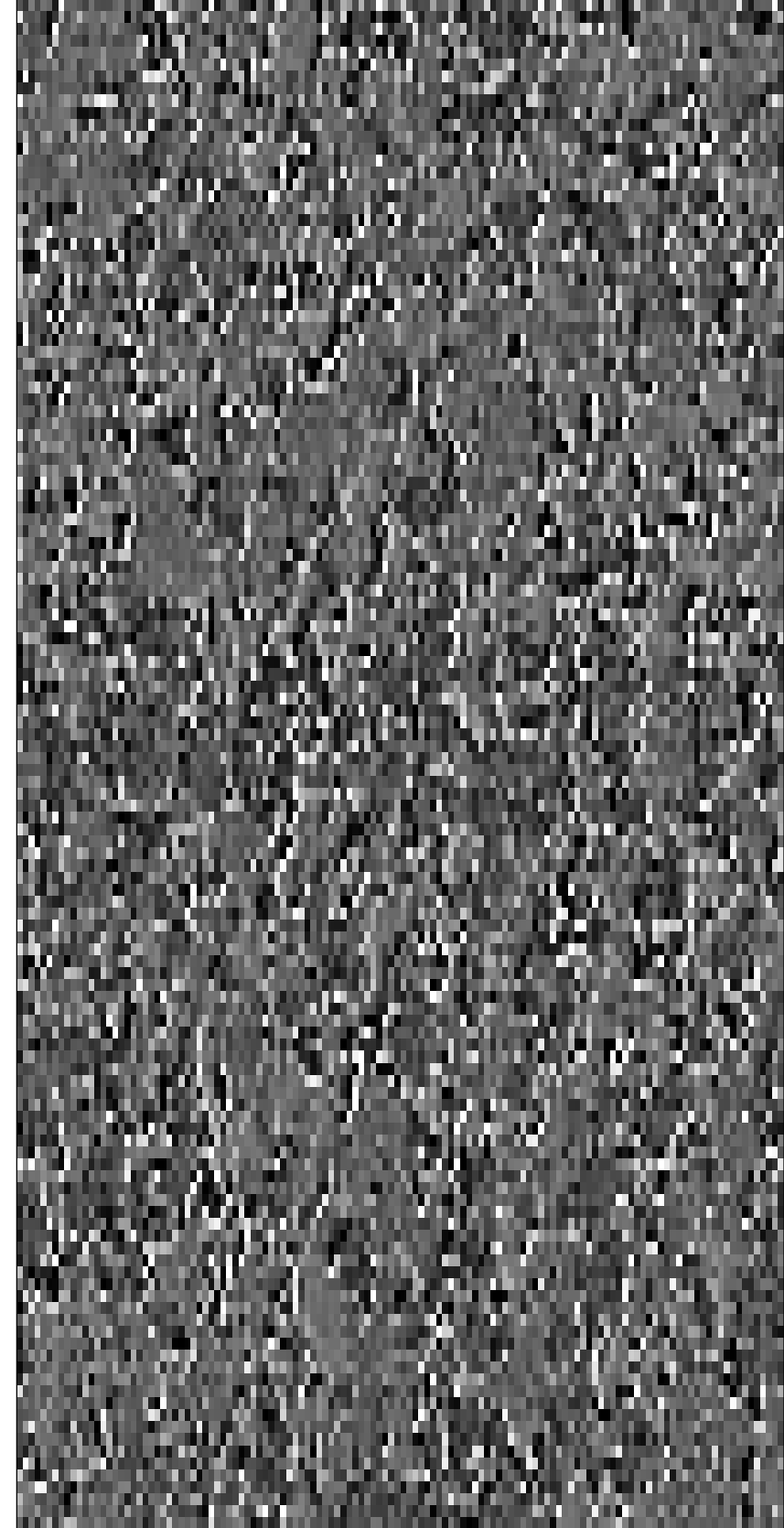
TI * PEF